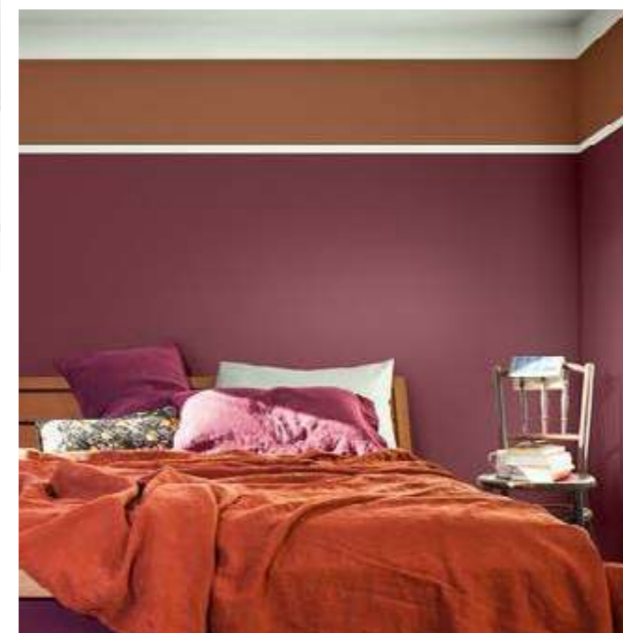
RICH, INTENSE PAINT SHADES GIVE A FEELING OF HERITAGE AND WARMTH