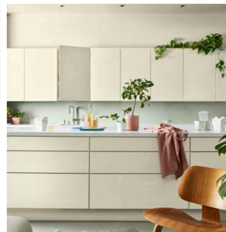
PLANTS COMBINED WITH PASTEL HUES CREATE AN INVITING, NURTURING ENVIROMENT