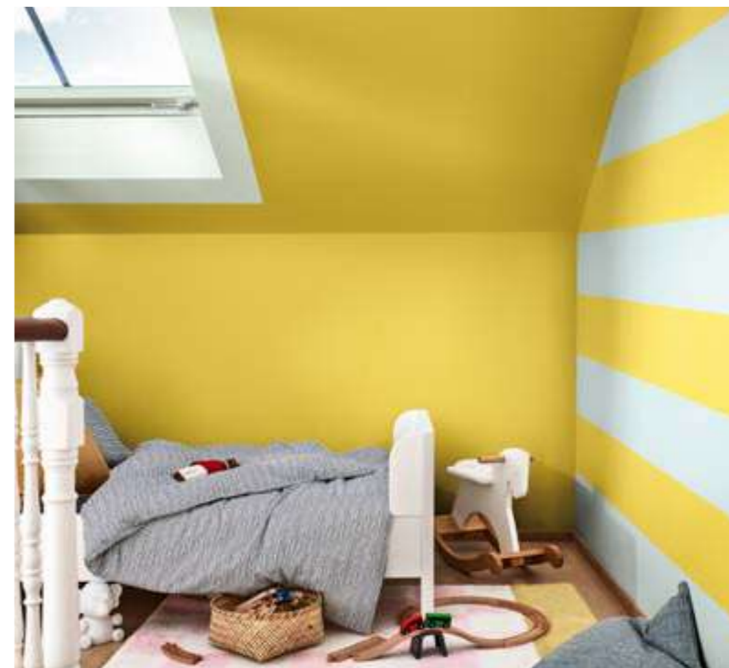
A BRIGHT AND PLAYFUL LOOK PROVIDES AN ANTIDOTE TO THE STRESS OF MODERN LIFE